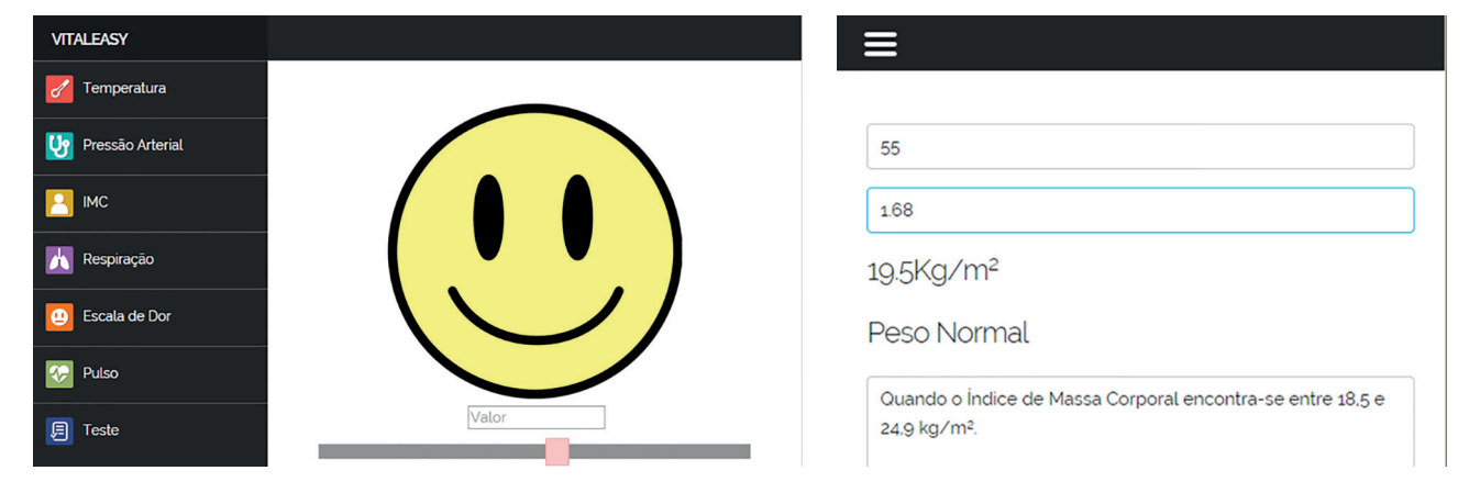
Figure 1 – Verification Screen of vital sign Pain and BMI. Features that present a Pain Scale with variations between 1 and 10, reference values for the BMI together with the concept and nomenclature. Fortaleza, CE, 2014.

In the test (Figure 3) tab, the student can answer direct questions with multiple alternatives, on topics such as terminology, reference values, semiotics, equipment