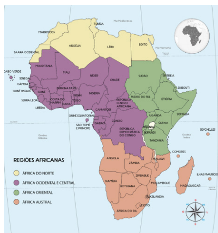
Map 1: African Continent