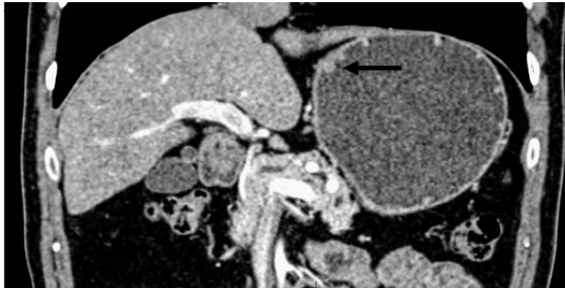
Figure 1: Contrast enterotography demonstrating a polypoid lesion in the small curvature of the stomach (indicated by the arrow).