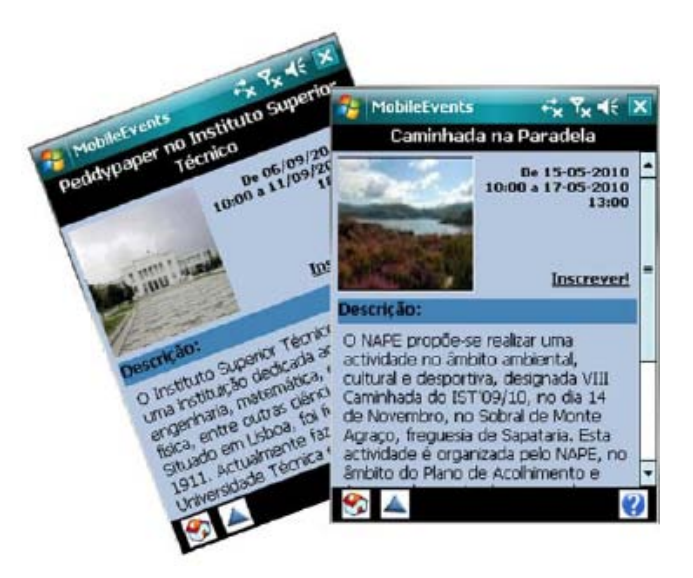
Figure 6: Peddypaper at IST and walk at Paradela in MobileEvents.

Furthermore, the students of Instituto Superior Técnico, in Lisboa, will have a chance to participate in a peddypaper created by us together with its Student Association.