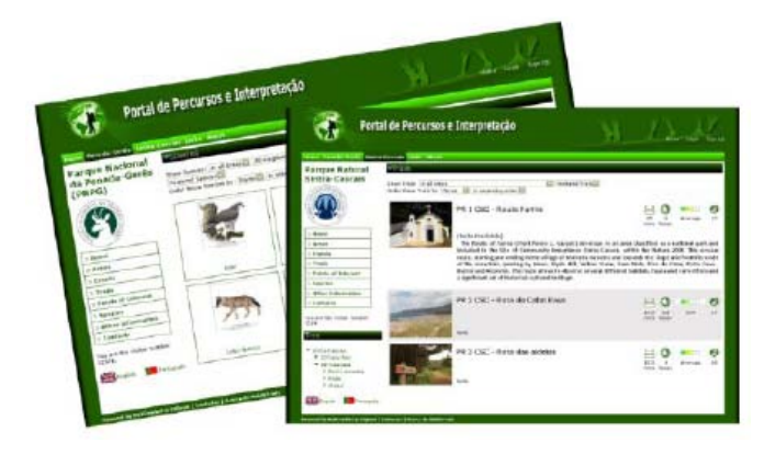
Figure 5: Peneda-Gerês and Sintra-Cascais Context's page.

because the previous version of the WebTrails already allowed the creation of certain types of content, the validation of both services was conducted independently.