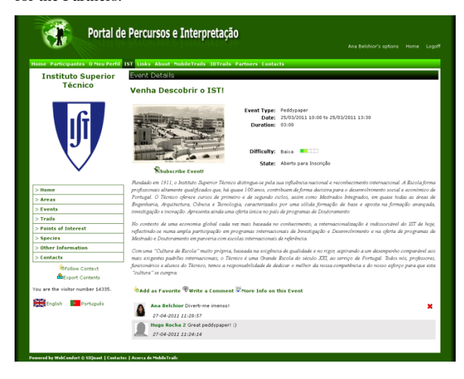
Figure 3: Peddypaper event information page.

The events are defined through the WebTrails portal by the Partner (see Figure 3). The peddypaper can be created from scratch or use an event-template previously created. An event-template can be created from scratch or through an already created event, and can be reuse. The templates are only available for the Partners.