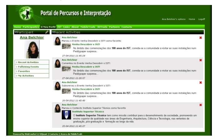
Figure 4: The participant profile.

After the event realization all Participants are entitled to a personal page where they can access information about all events they participated and subscribed, view results and make comments (see Figure 4).