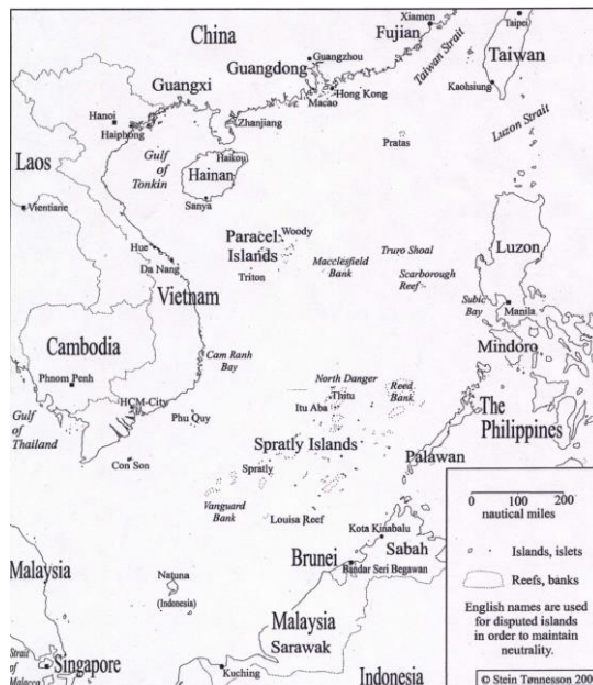
Figure 1 – The South China Sea 2

The SCS is a semi-open sea and surrounded by China, Vietnam, Malaysia, Singapore, Indonesia, Brunei, Thailand, Philippines and Taiwan. The SCS has a total dimension of approximately 3.600 square kilometers and it connects to other seas through the Taiwan Strait, the Lombok Strait and the Malacca Strait, making a strategic connection between the Indian and Pacific Oceans. Between the main groups of islands, stands out the Paracel, in its Northwest portion, and Spratly, in the centre of the Sea, both being the focus of the most part of the territorial disputes (Beckman 2012, 3). Figure 1 below brings the representation of the Sea in question, identifying its main elements.