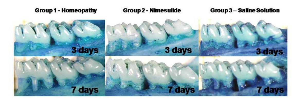
Figure 1 – Illustrative effect of homeopathy, nimesulide and saline solution on the alveolar bone loss in experimentally-induced periodontal disease in rats (upper panel) as well as values expressed as mean ± standard error of mean (lower panel). * indicates statistically significant difference in comparison with homeopathy (p<0.05).