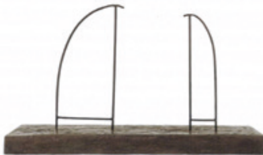
Figure 3. GONZAGA, Luiz. Rito de passagem: o direito de ir e vir . 2001. 1 Polychrome bronze sculpture, 32 x 53.5 x 23.5 cm. Photography by: Pierre Yves Refalo. Available at: http://www.gonzagaartistaplastico.com.br/site.asp?link=obras/1986_01.html _Acesso em set.2017 Access in Sept.

placed in the void of space. His allusion to seminal and germinal rites, to the development of life, does not prevent him from seeing men themselves trapped in great arches of passage.