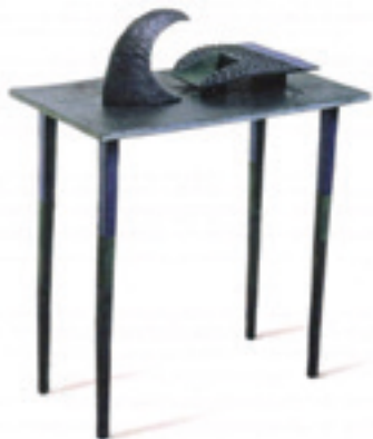
Figure 2. GONZAGA, Luiz. Os sons da floresta, em certos momentos II . 1999. 1 Polychrome bronze sculpture, 94 x 72 x 39 cm. Photography by: Pierre Yves Refalo. Available at: http://www.gonzagaartistaplastico.com.br/site.asp?link=obras/1986_01.html _Acesso em set.2017 Access in Sept.2017.

swim in the river he took has pointed him to an entire existence: he then looked at the world around him, especially at nature, at the phases of day, at the sap of the earth, at the seeds and their germination, at the curves of nature, of bodies and of shelter, at the night clenched by horns, at the great nocturnal, at the dew, at the sounds of the forest. He felt the sting of his destiny, of merging with these matters, of problematizing them critically in his figurations, of becoming, at last, a kind of messenger of a forgotten but incarnate time, he began his quest for a lost time. Like Proust 5 , but in his own way, Gonzaga became a seeker of what the processes of humanization caused man to forget about himself. He invented images imbued with this message, images of a man-made absence against its muddy origins. His language, always critical, nevertheless, was also always tender. There are no strident cries in its forms, only a strange germination springs from them, a human outline allows the idea of an animal and vegetable content and also, its fantastic small table in which is housed a small anvil and of which it is said that one can hear sounds of the naked and cruel nature where life is engendered.