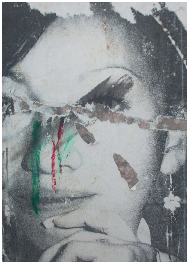
Figure 6: Fig. 6. Teresa Margolles. Pesquisa (2016). Detail.

4 - Exhibition Report. The statement can be consulted here: https://forensic-architecture.org/programme/exhibitions/disappear [visited December 2019]