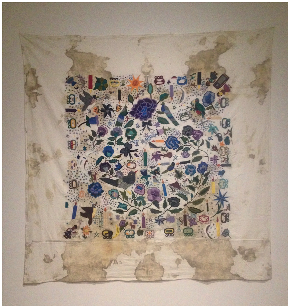
Figure 5: Teresa Margolles. Embroidered fabric (2012). Installation view.

Considering the high level of impunity and the misleading use of juridical instruments for the protection and reparation of victims in Mexico, it is understandable that the vast majority of cases never reach the court as formal accusations and it is with no surprise that independent organizations consider the new official number an underestimation. For them, most institutions devoted to collect information operate de facto as an obstacle to this very goal. More often than expected, State-level officials participate in the destruction of incriminating evidence, giving new meanings to the expression “The Forensics of War” –coined in 1999 by Sebastian Junger in his comment on the Kosovo’s humanitarian crisis (Junger, 1999). Today, it seems accurate to better describe the juridical situation in Mexico as ‘A War on Forensics’, truly a battle for the production and control of evidence.