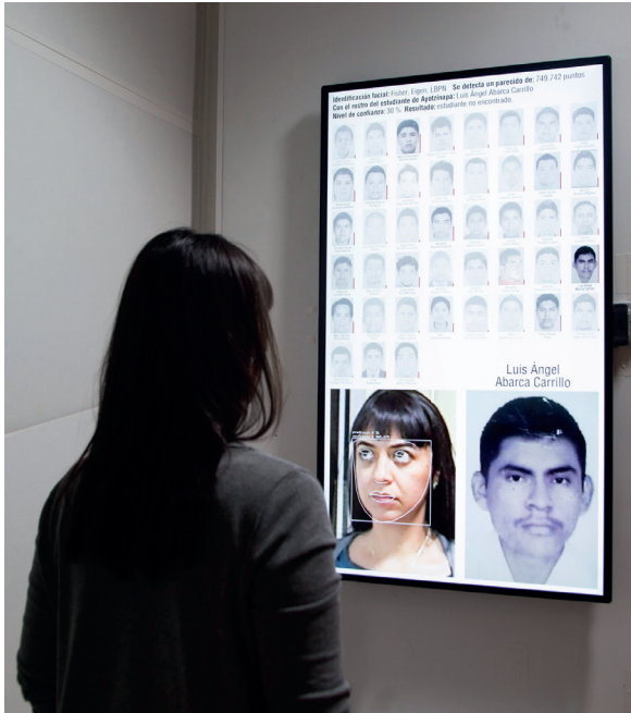
Figure 2: Rafael Lozano-Hemmer. Level of Confidence (2015). Installation view.

Sensing objects, experiencing architectures, and feeling evidence are, strictly speaking, investigative tools. The aesthetic materiality of the physical world intensifies our capacity to make sense –so to speak– of the cognitive, political or ethical dilemmas of our society. For Weizman, "Investigative aesthetics slows down time and intensifies sensibility to space, matter and image. It also seeks to devise new modes of narration in articulating new truth claims" (Weizman, 2017: 94). From this point of view, truth is not only grounded on aesthetics; it also demands the implication of the object/subject sensorium in order to accomplish its deep political goal as res publica [coisa do povo, coisa pública]. In fact, most of the projects developed by Forensic Architecture criticize the idea that we live in a post-truth or post-factual epoch, with no capacity to rise the architecture of our common political discourses on evidence and facts.