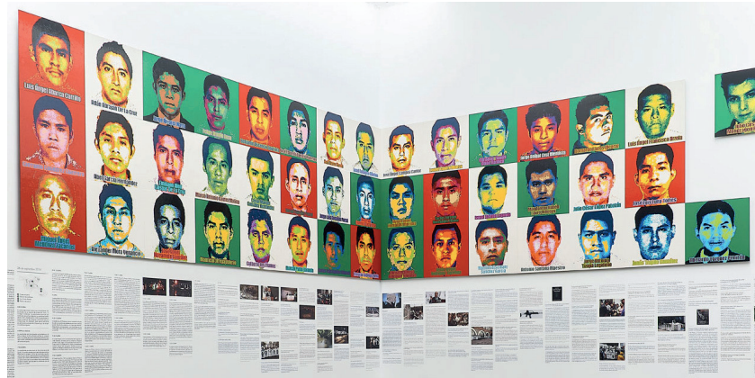
Figure 3: Ai Weiwei. LEGO Portraits-Ayotzinapa Case (2019). Installation view.

For this project, Forensic Architecture collaborated with Equipo Argentino de Antropología Forense (EAAF), family members of the detained-disappeared students, and the Human Rights Center Miguel Agustín Pro Juárez (known as Centro ProDH), a local NGO founded in 1988. Considering the variety of actors involved, it is difficult to articulate in one lineal narrative all the details of the case. In a nutshell, the disappearing of the 43 students runs something like this: on the night