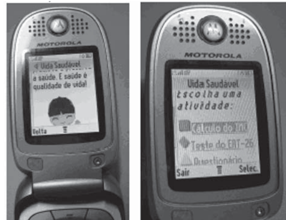
Figure 4 – Example of two learning objects of an educational course on mobile phone.

Figure 4 shows two LO with mobile phone interface. The first one shows text, audio and video of the agent "Vivita" already with interaction options. The second shows the mobile interface for the same screen seen in Figure 3 (IMC calculation, EAT-26 and questionnaire).