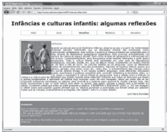
Figure 1 – Learning object “Other Childhoods” on its original format

each new page, a new image was associated, to keep the website pedagogic model.