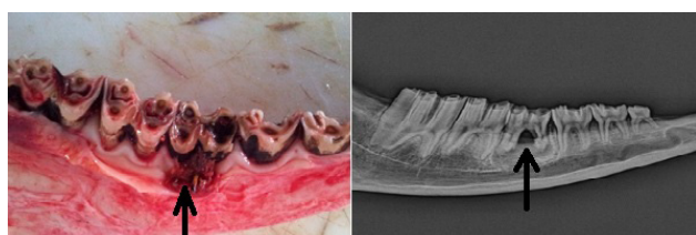
Figure 3. Periodontal inflammation and caries in 5-year-old dairy cow.