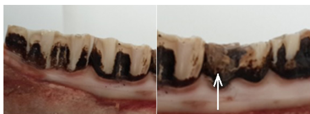
Figure 1. Dental colour changes in a caries lesion on the tooth of a dairy cow.

In this study 34 caries (20%) were identified (Figures 2 and 3). The caries localization: 14 in mandible, 16 in maxillae, and 2 in both was determined. It was seen that 7 of the caries in mandible were right, 6 were localized on the left, and 3 were double-sided. Maxillary caries were found to be 10 in the right, 4 in the left maxilla, 4 in both. The distribution of the caries and periodontal inflammation in the cases is detailed in Table 2 and the localizations of the caries on the teeth in Table 3.