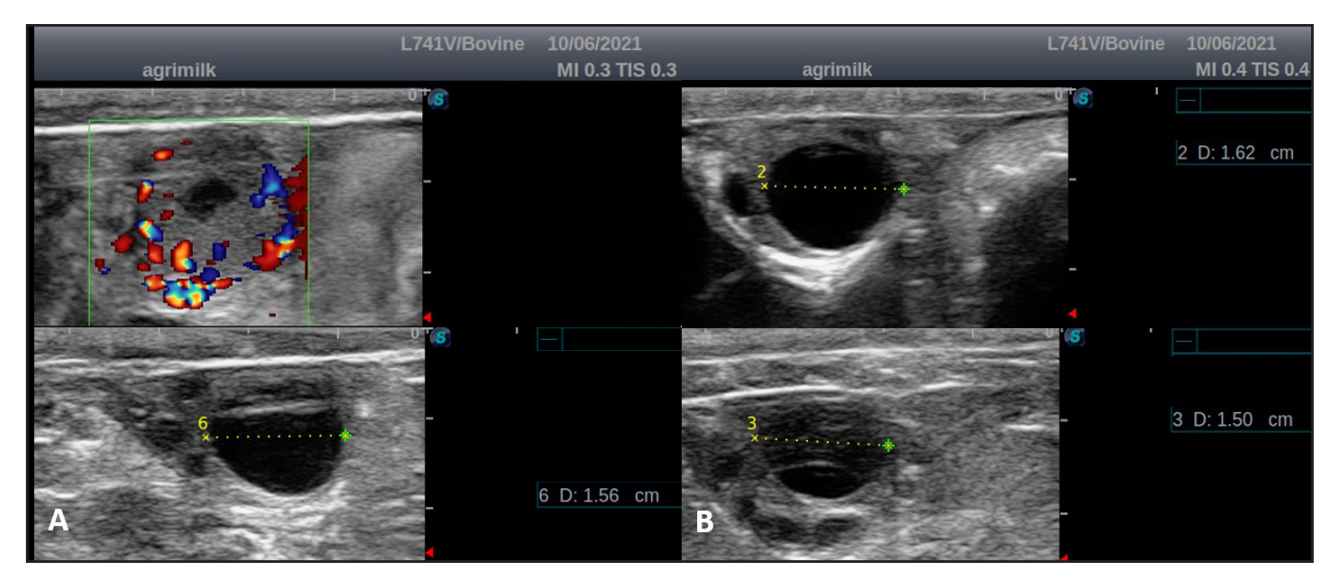
Figure 2. Ultrasound image of the ovarian status in heifers on day of TAI. A- Follicles with corpus luteum located in one of the ovaries. B- Preovulatory follicles without corpus luteum.

Table 1. Ovarian status at the begin of the treatment, on day of TAI and pregnancy rate in different groups according to used estrus synchronization protocol.