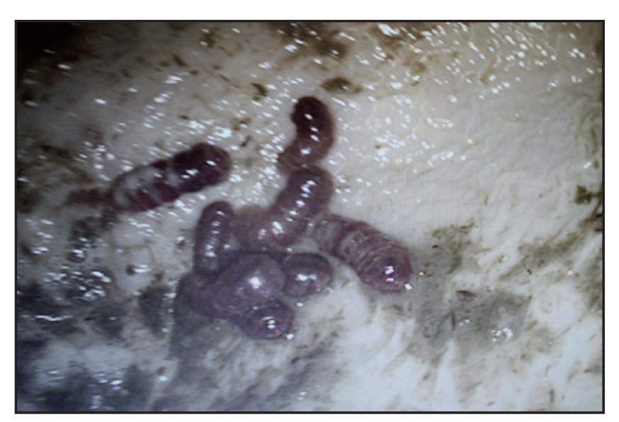
Figure 1. Image of Gasterophilus intestinalis larvae attached to the stomach lumen of a weanling foal. Gastroscopy exam was carried using a flexible endoscope (Olympus) through nasogastric access.

*There was not observed difference between groups (P > 0.05). SD= Standard deviation; <sup>1</sup>MCV= Mean corpuscular volume; <sup>2</sup>MCH= Mean corpuscular hemoglobin concentration.