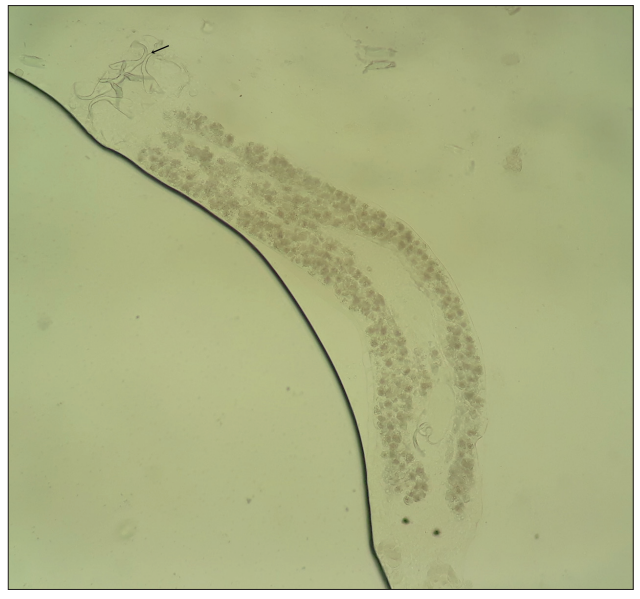
Figure 1. Monogenea parasitism in tilápia-do-nilo, skin scraping, direct examination. There is a monogenetic worm suggestive of gyrodactylid with hooks at its end (arrow) [obj.40x].

of a parasitic cyst with compression of the viscera and death. Microscopy revealed a focal cyst of a fibrous capsule, which occupied 50% of the visceral cavity, containing various transverse and longitudinal sections of pseudocelomatised nematodes, with thick, wavy integument, amber color, celomary musculature and large intestine, covered by columnar uninucleated cells.