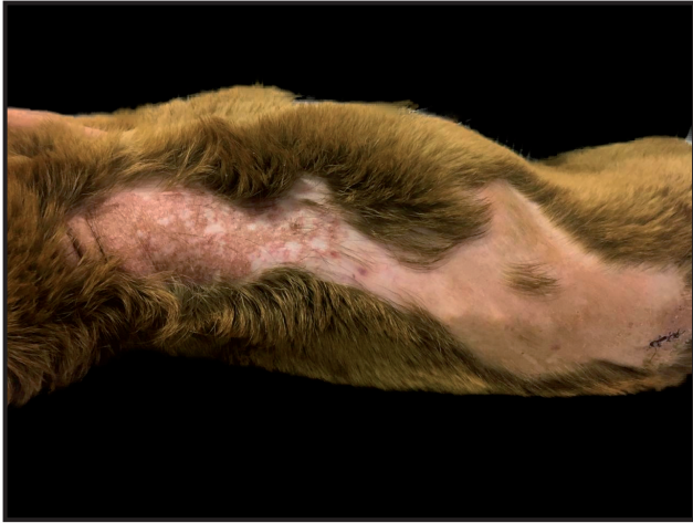
Figure 1. Dog, skin, dorsal view, Calcinosis cutis. Alopecia throughout this region with coalescent, firm, yellowish-tan papules forming plaques with gritty material mainly located at the thorax.

pyogranulomatous inflammation and perilesional fibrosis. Furthermore, epidermis reveals transepidermal elimination of mineral and mild pyogranulomatous inflammatory reaction. Together, the findings led to the final diagnosis of calcinosis cutis (Figure 3).