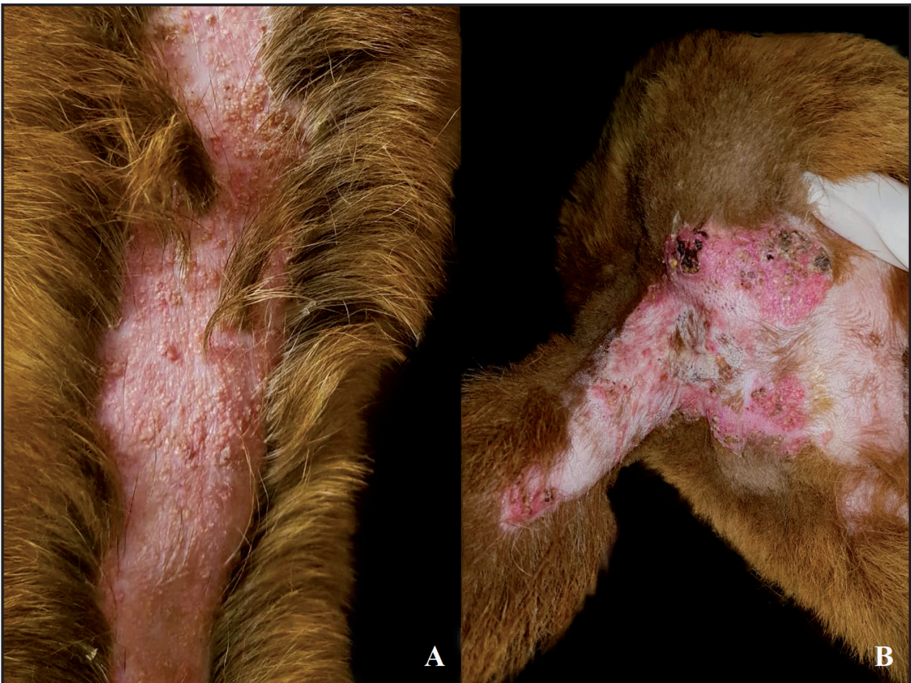
Figure 2. Dog, skin, Calcinosis cutis. A- Approximated view of dorsal thoracic lesions presenting irregular papules and plaques. B- Skin, hind limbs, anus, and tail regions with plaques showing redness and crust due to secondary inflammation and ulceration.

After confirmation of the diagnosis of HAC, treatment with trilostane (Vetoryl®) 8 was applied at a dosage of 0.5 mg/kg in each 12 h, with dose adjustments every 21 days in order to minimize the chances of side effects. Amoxicillin with clavulanic acid (Age-moxi CL®) 9 at a dose of 25 mg/kg in each 12 h for 21 days was used to control secondary bacterial infection. Also, topic treatment with moisturizing baths and antiseptic spray twice a week were considered. The antiseptic spray was manipulated with chlorhexidine