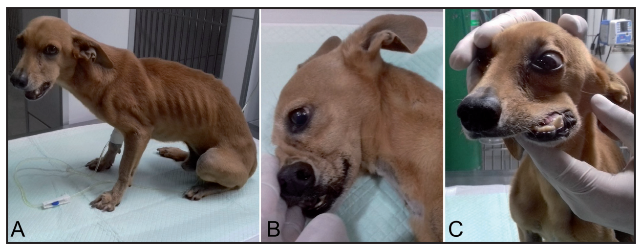
Figure 1. Physical examination of a four-year-old male mongrel dog with fibrous osteodystrophy secondary to chronic kidney disease, with body score 1 (A) and muzzle flexibility, with lateral dislocation and dental friction between the maxillary bone (B) and the mandible (C), characteristic of "rubber jaw".