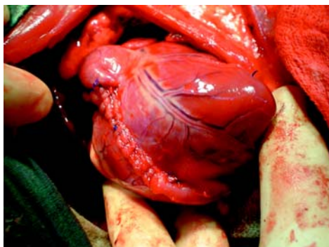
Figure 2. Final aspect of the heart submitted to the Beating Heart Partial Ventriculectomy in the right ventricle. Note the suture area that is still viable, showing the non-ischemic characteristic of the suture and the absence of bleeding. A small branch of a coronary artery was ligated with polypropylene suture.