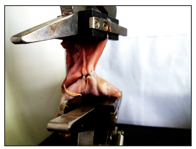
Figure 3. Tensile test on the EMIC 23-5D tensiometer.